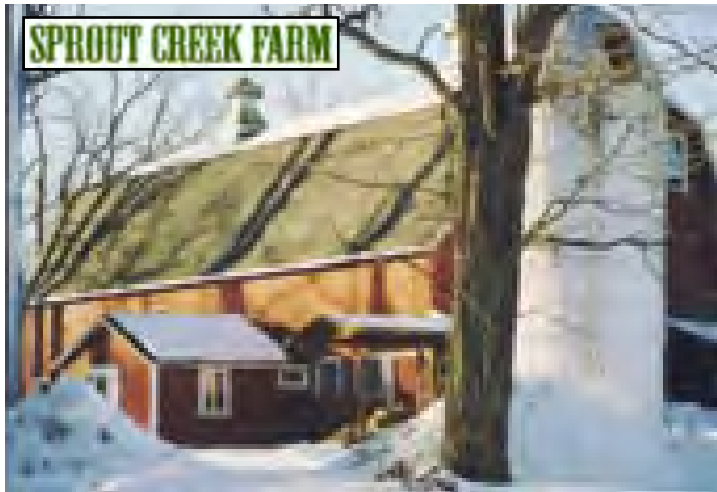
You can visit this free-range farm in Poughkeepsie ( sproutcreekfarm.org ).