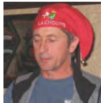
Advance scout for the Chouffe gnomes in NYC.